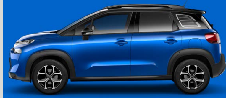
Voltaic Blue (M)