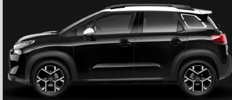
Perla Nera Black (M)