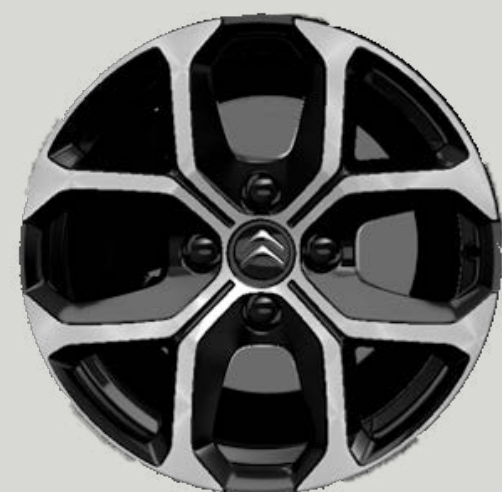
16 inch 'X Cross' diamond-cut alloy wheels