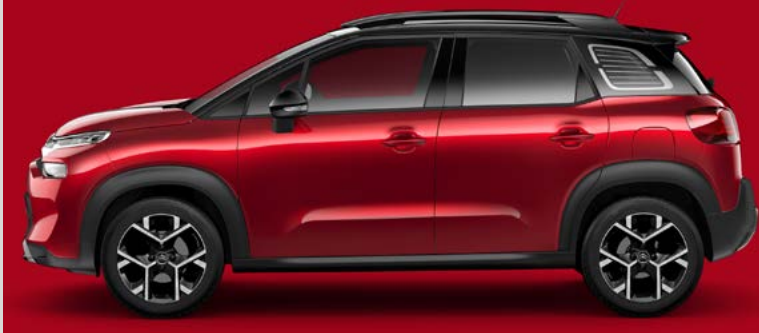
Pepper Red (M)