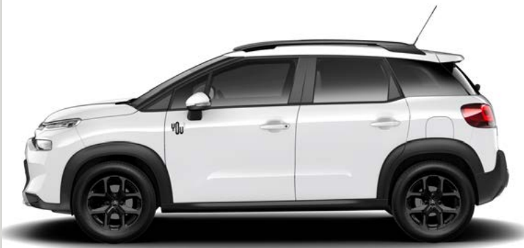
Polar White (F)