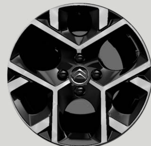
17 inch 'Origami' diamond-cut alloy wheels